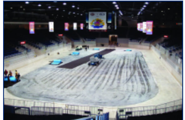
The Toronto Boat Show commissioned Flexi-Liner to create a 1,000,000-gallon indoor lake over the Ricoh Coliseum hockey rink.

Flexi-Liner™ products have been installed throughout the world and are trusted by Fortune 500 and owner-operators alike.