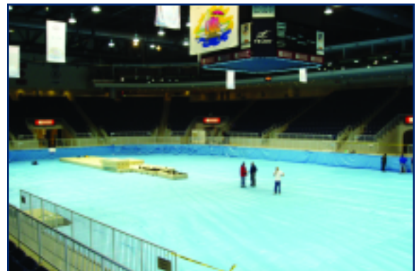
The Coliseum schedule allowed 24 hours to install the 32,000 square foot liner.